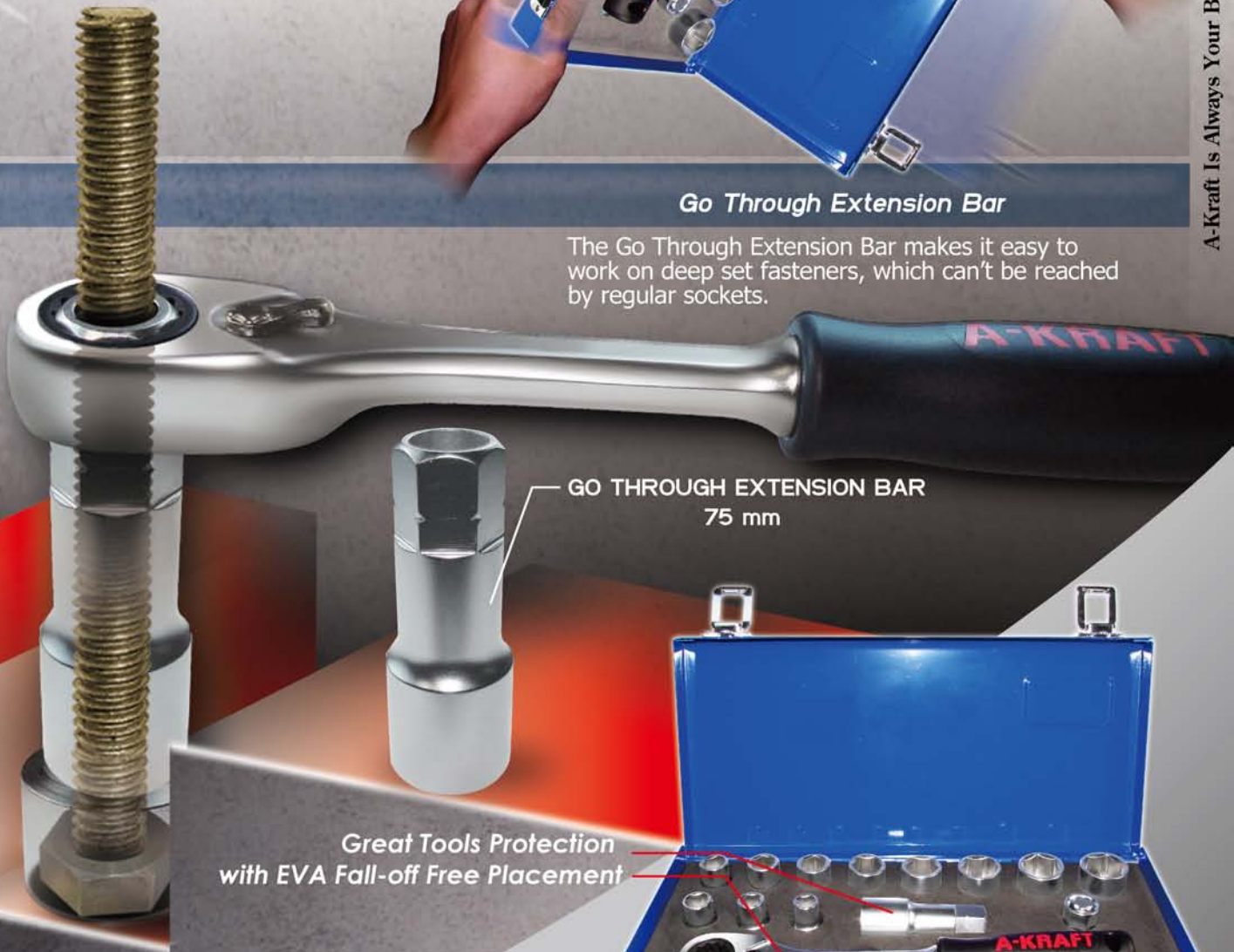
GO THROUGH EXTENSION BAR 75 mm

The Go Through Extension Bar makes it easy to work on deep set fasteners, which can't be reached by regular sockets.